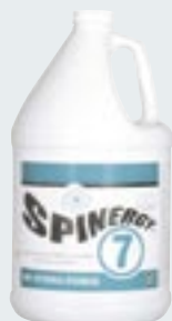
▲ Spinergy 7