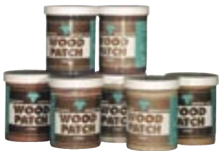
▲ Bridgepoint Wood Patch

Repair damaged areas using Bridgepoint Wood Patch . Deep scratches and large separations need to be filled.