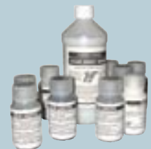
▲ Clear Grout Sealer and dyes